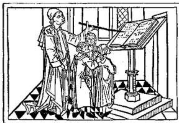
The Singing Lesson; from Spiegel des menschlichen Lebens, Augsburg, about 1475-76.

Class Pre-Registration ends September 16.