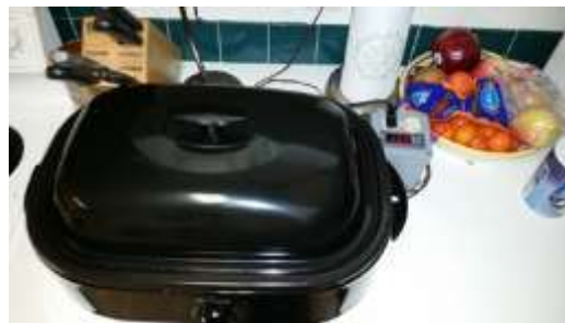
Sous vide cooking