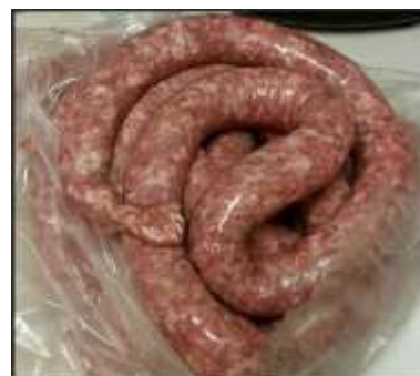
Custom Grind Sausages