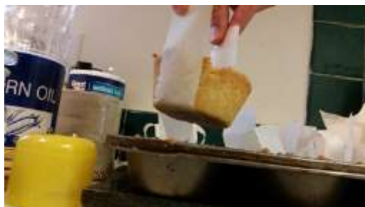
Removing Pies with Parchment Paper